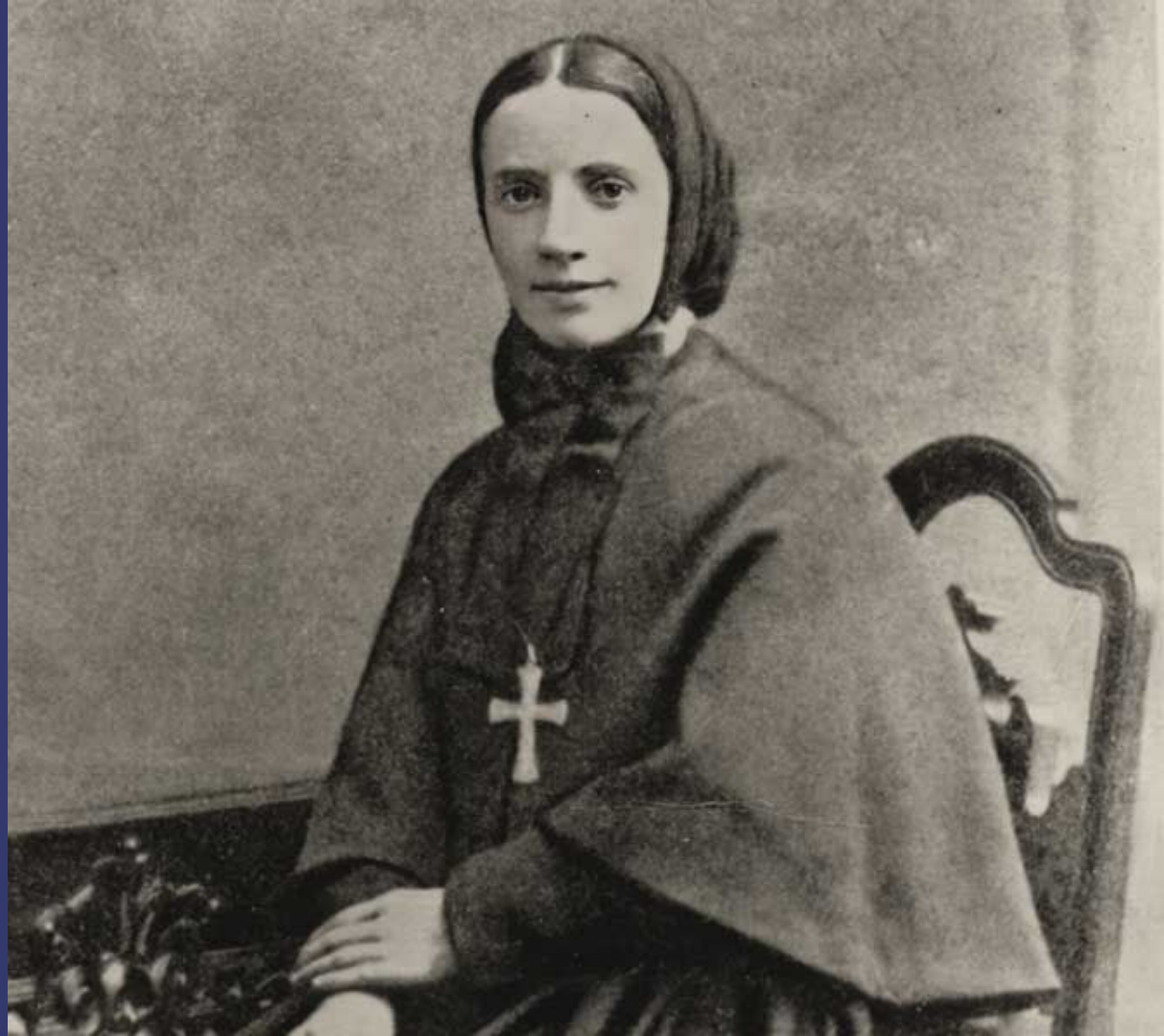
St. Frances Xavier Cabrini